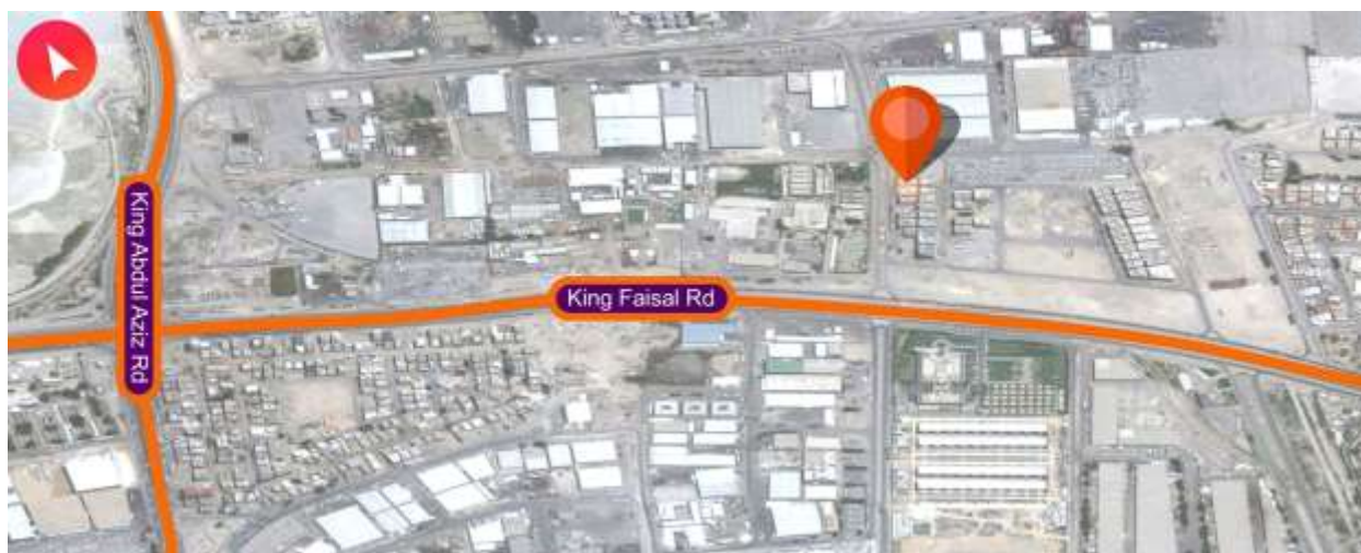
Fourteenth Asset: Staff Residential Buildings in Dammam